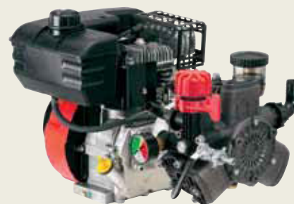
AR 303 S Honda AR 403 S B&S