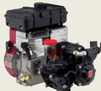
AR 115bp S B&S AR 135bp S Honda