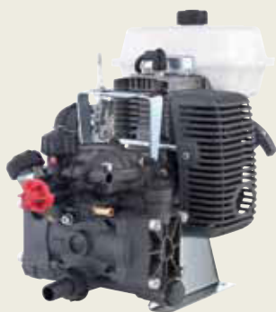
AR 202 S Oleomac S 50