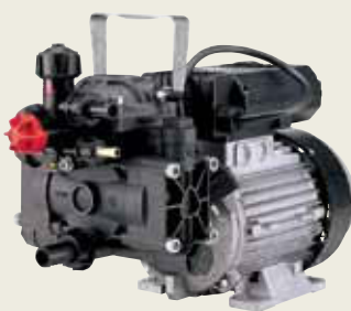
AR 202 EM-ET AR 252 EM-ET