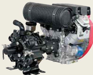
AR 1064 S Honda AR 813 S B&S