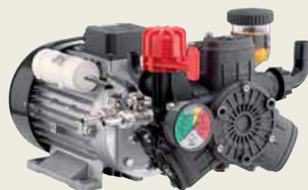
AR 303 EM-ET AR 403 EM-ET