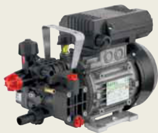
AR DUE EM AR DUE DC 12-24 volt