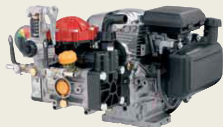
AR 30 S Honda AR 50 S B&S