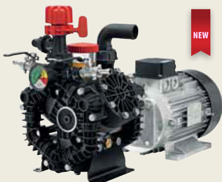
AR 45bp EM