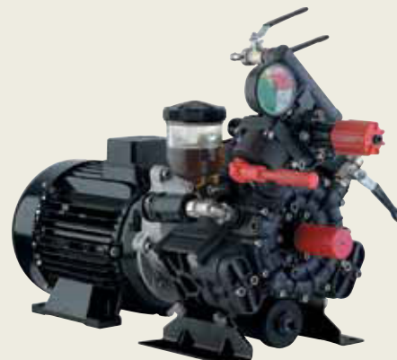
AR 813 ET